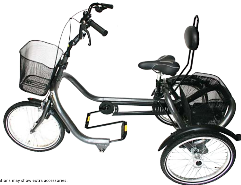
The illustrations may show extra accessories.